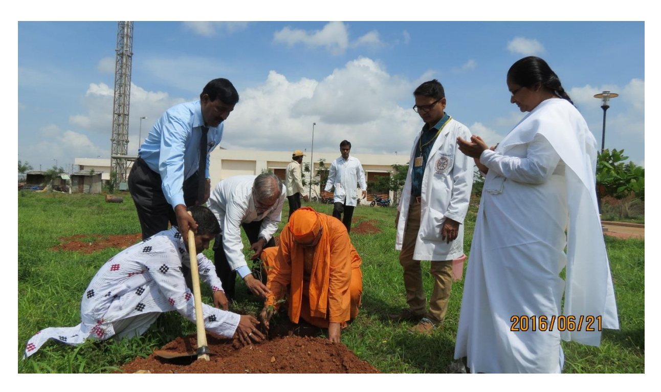
Tree plantation was done in the lawns in front of Department of Anatomy